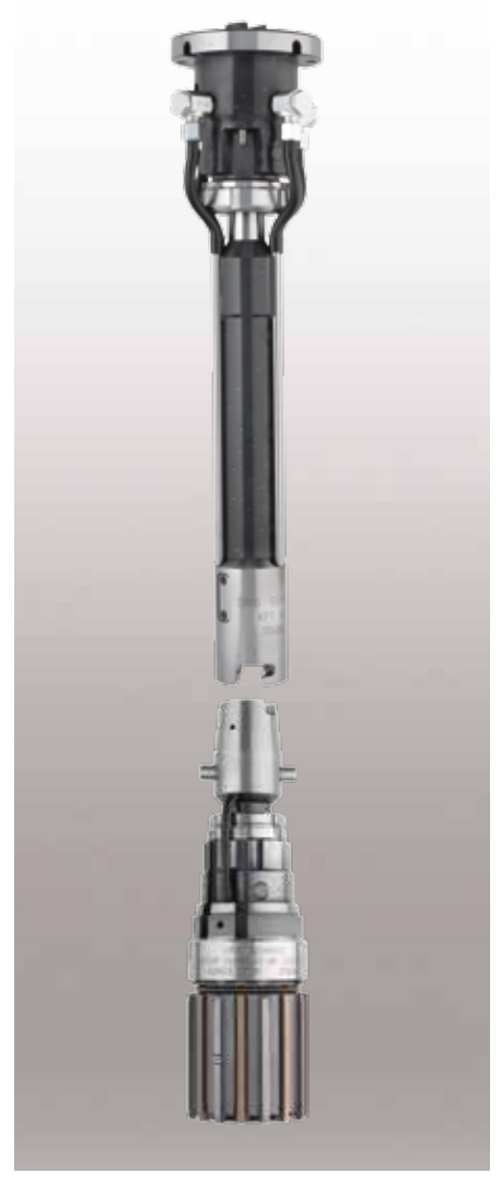
PT honing tool and connecting piece