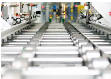
Gehring roller conveyor

We have added a variety of different automation options to our product range and offer you everything from a single source, true to our motto of „Total Customer Care“.