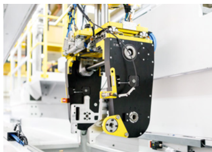
Gehring gantry system