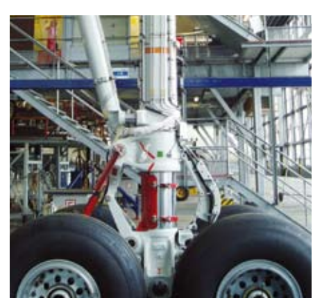
Blind bore in landing gear