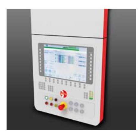
Gehring Operator Panel

The program assistant is also optimally rounded off by a user-friendly easy-to-understand operating interface called the Gehring Operator Panel (GOP). The operator can save an almost unlimited number of processing programs and tool datasets. The integrated work report automatically determines the start point for repeat jobs, and the processing program significantly reduces the set up times for repeat jobs. Work can therefore start immediately without any time-consuming programming.