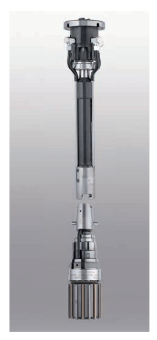
PT honing tool and connecting piece