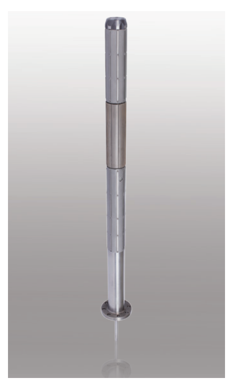
Crank bore honing tool

The LSR module can alternatively be equipped with one or two honing units and optionally supplemented by an automatic tool changer. In combination with the HSK connection, quick tool change can be assured. Overall, this machine offers quality at the highest level.